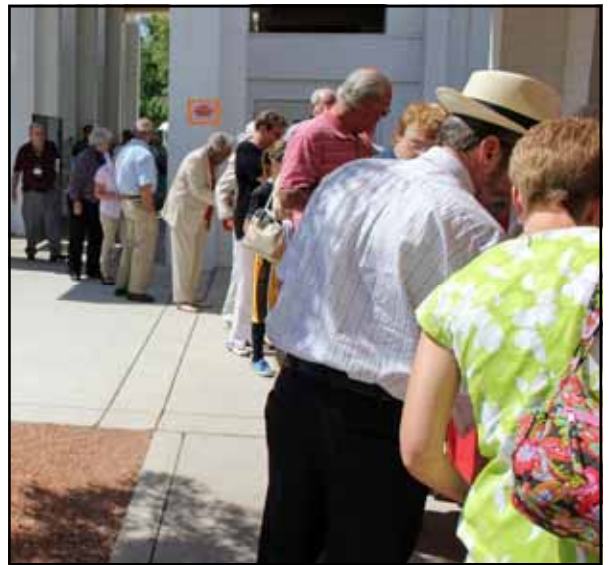
Trinity United Methodist members patiently wait in line to sample pies for the Society of St. Stephen fundraiser held in June.

Donations to the Helping Hand Up program may be made by specifying the Pastor's Discretionary Fund as the contribution purpose.